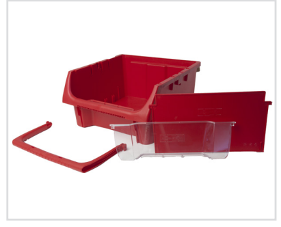
Modul-Box 324 x 324 mm, Part No: 10487-03 Divider, width 324 mm, Part No: 10488-03 Window, width 324 mm, Part No: 10489-03 Handle, width 324 mm, Part No: 10490-03