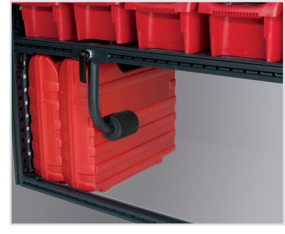
Load stop Part No: 50250-03