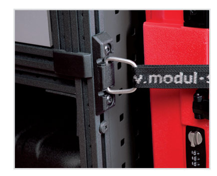
Lashing eyelet Part No: 50025-03