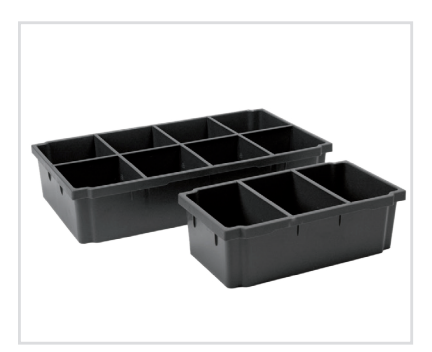
Insert for drawers For 108 mm high drawer, Part No: 10530-03* For 108 mm high drawer, Part No: 10533-03** For 162/216 mm high drawer, Part No: 10535-03*** *162 mm length, 324 mm length, *324 mm length, 486 mm depth,

<sup>1</sup>162 mm length, 324 mm depith, <sup>--</sup>324 mm length, 486 mm d <sup>***</sup>324 mm length, 324 mm depith.