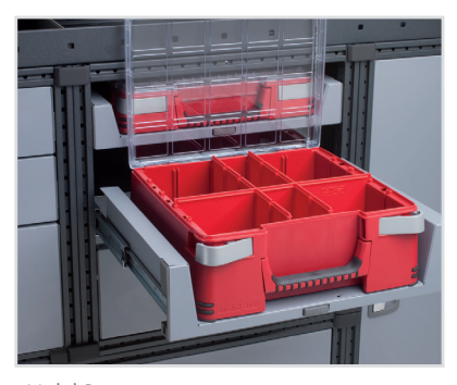
Mobil-Box Part No: 10566, width 486 mm (low) Part No: 10563, width 486 mm (high)

Kit tool holders Part No: 10848 (15 pcs) Part No: 10849 (30 pcs) Part No: 10850 (50 pcs)