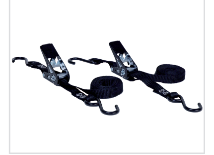
Lashing with narrow strap, 2.0 m (2 pcs) Part No: 11722