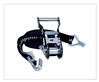
Lashing with ratchet, 4.5 m Part No: 11716

Modul-Box 162 x 324 mm, Part No: 10480-03 Modul-Box 162 x 486 mm, Part No: 10481-03 Divider, Width 162 mm, Part No: 10482-03 Window, Width 162 mm, Part No: 10483-03