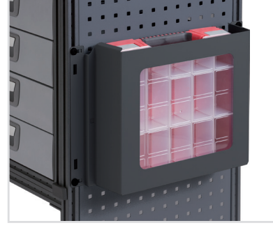
Storage holder for Mobil-Box Part No: 50230-03